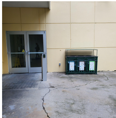
Image 4: River Front Center outdoor space only area with outdoor electrical outlet