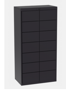
Figure 3: 14-Door medium locker