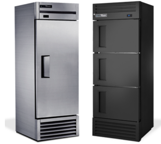
Figure 5: Luxer Fridge