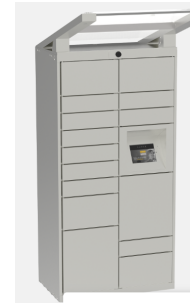
Figure 6: Outdoor units