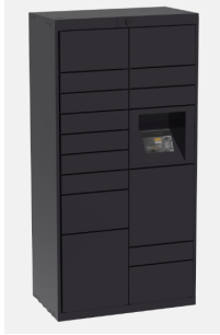
Figure 1: Main unit