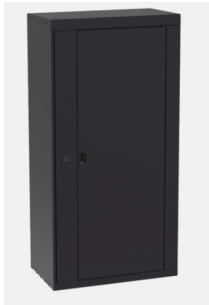
Figure 4: Oversized